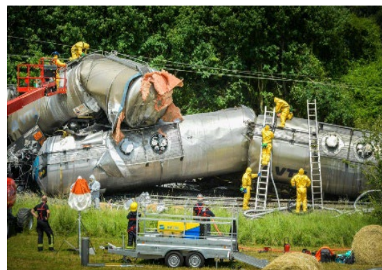
Derailment of a train transporting phosphoric acid