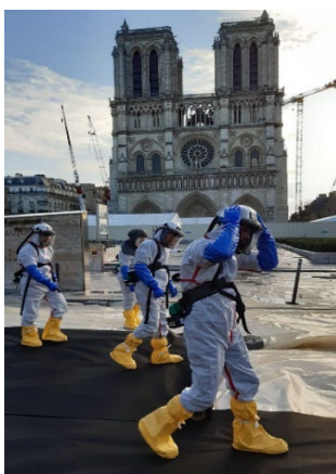
Lead decontamination at Notre Dame